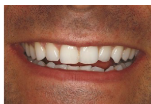
Anterior smile view (1:3 on most digital cameras)