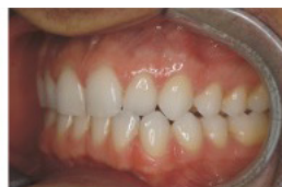
Left retracted view, teeth in occlusion (1:3 on most digital cameras)