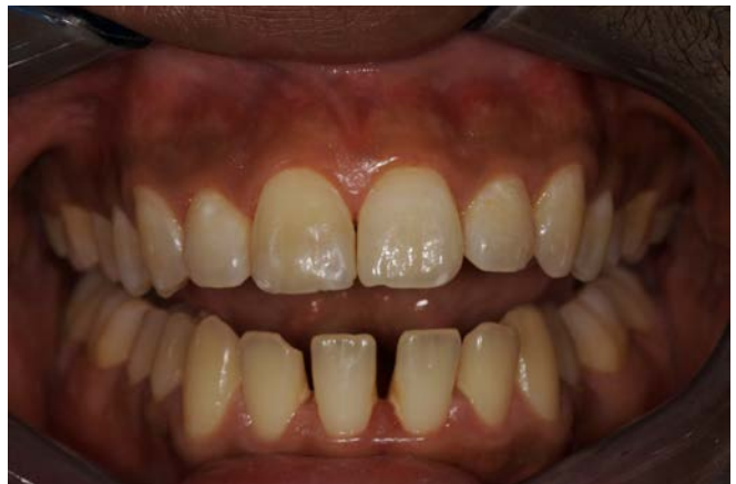
A class IV composite was placed following trauma