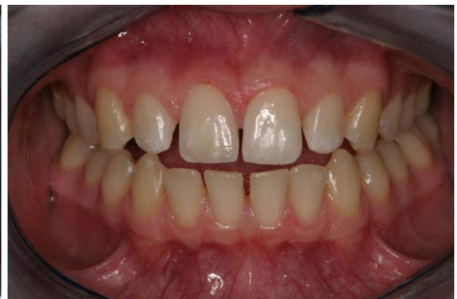
A class IV composite was placed following trauma