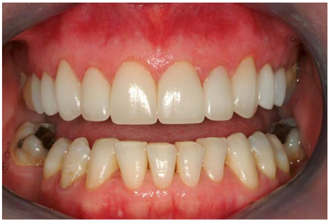
10 porcelain veneers and bleaching were used to improve shapes and alignment.