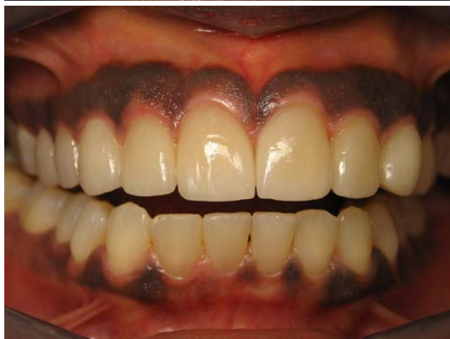
A replacement bridge combined with veneers to improve appearance and close spaces