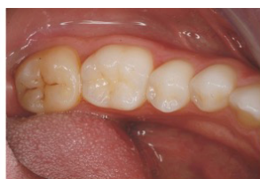
Lower left quadrant view, teeth parted (1:1.5 on most digital cameras)