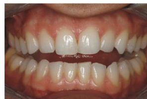
Anterior retracted view, teeth parted (1:3 on most digital cameras)