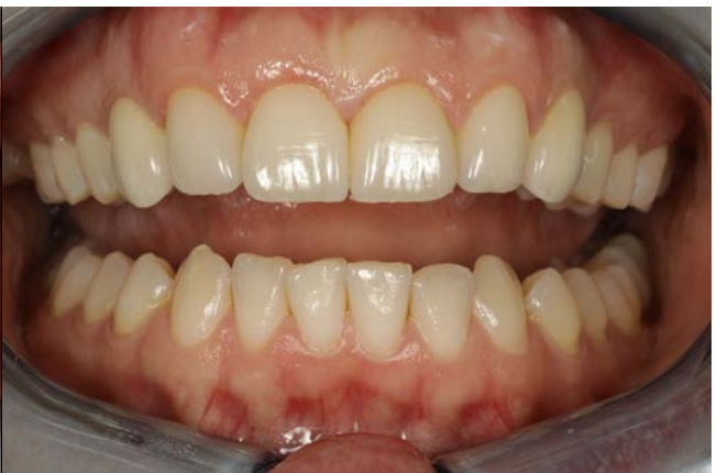
Patient has congenitally absent lateral incisors and canines are in lateral incisor position. Following orthodontic treatment implants were placed in the canine sites and veneers used to disguise the natural canines as lateral incisors.