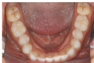
Lower occlusal view (1:3 on most digital cameras)