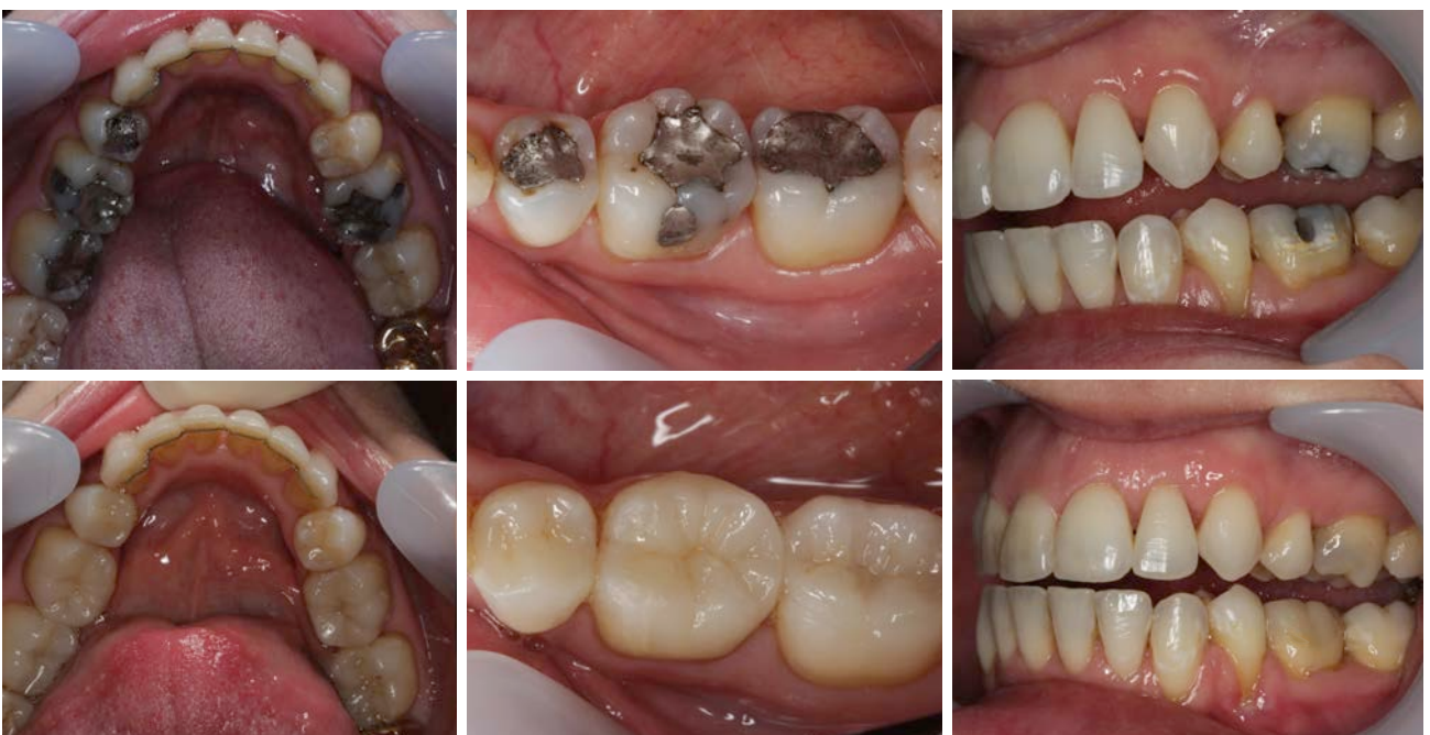
3 ceramic inlays were used to replace old amalgams and address cracks within the teeth