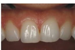
Anterior closeup view (1:1.5 on most digital cameras)