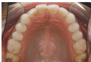
Upper occlusal view (1:3 on most digital cameras)