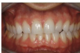
Anterior retracted view, teeth in occlusion (1:3 on most digital cameras)