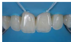
Image showing wet ethanol (ICON dry) in place