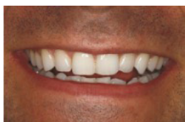
Anterior smile view (1:3 on most digital cameras)