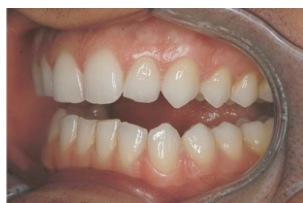
Left retracted view, teeth parted (1:3 on most digital cameras)