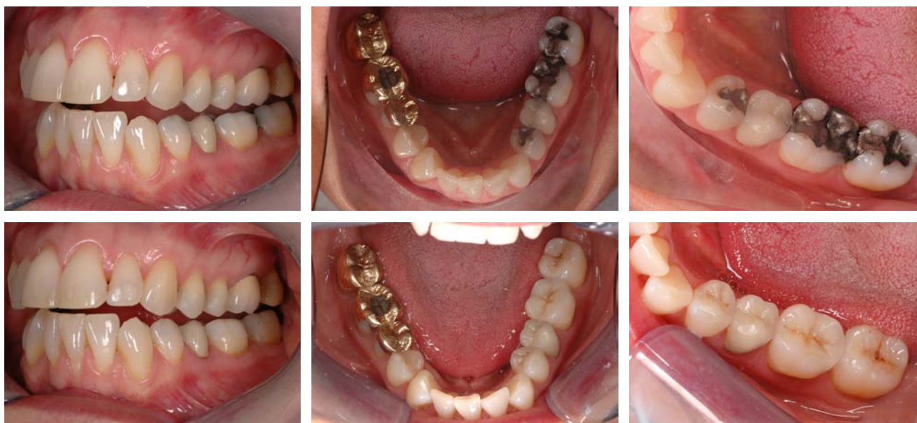
A combination of direct and indirect restorations was used to replace old amalgam restorations