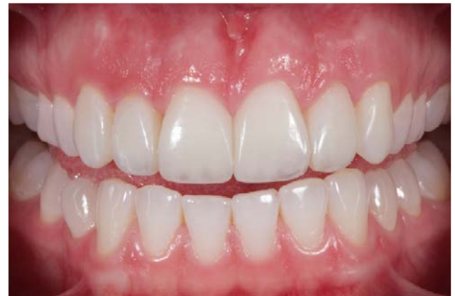
A combination of orthodontic treatment and 4 direct composite veneers were placed in this example