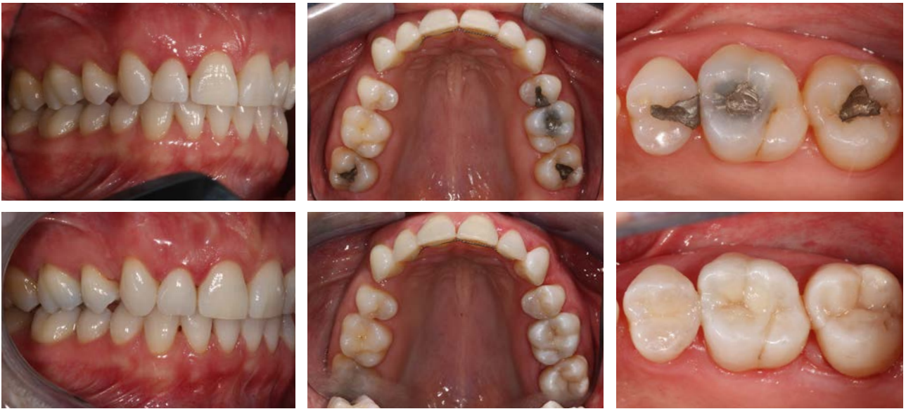
Direct resin restorations to replace old amalgams