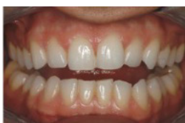
Anterior retracted view, teeth parted (1:3 on most digital cameras)