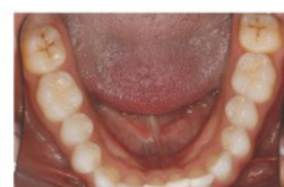
Lower occlusal view (1:3 on most digital cameras)