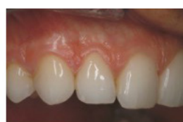
Right closeup view (1:1.5 on most digital cameras)