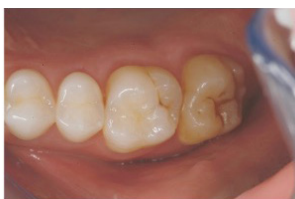
Upper right quadrant view, teeth parted (1:1.5 on most digital cameras)