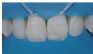
Dehydrated photo after etching