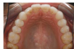
Upper occlusal view (1:3 on most digital cameras)