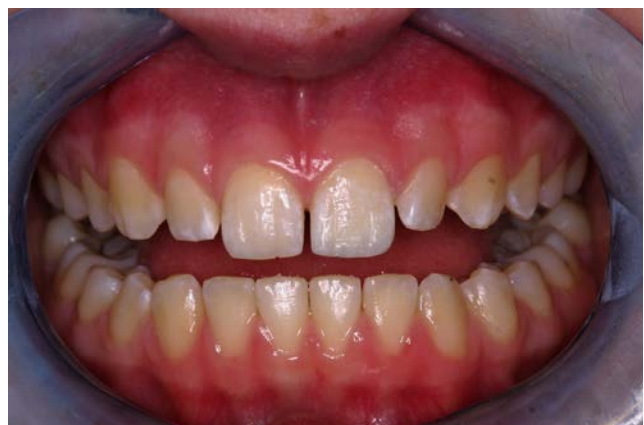
A class IV composite was placed following trauma