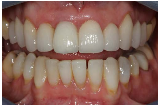
An implant was used to replace the UR1 following trauma