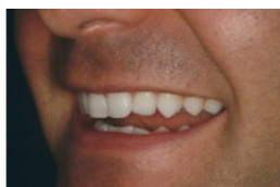
Left smile view (1:3 on most digital cameras)