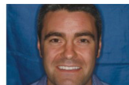
Full face (close to infinity on most macro lenses)