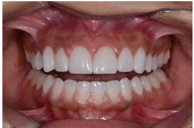
10 direct composite veneers were used to improve shapes and close small spaces