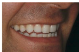
Right smile view (1:3 on most digital cameras)