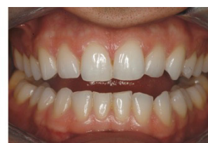
Anterior retracted view, teeth parted (1:3 on most digital cameras)