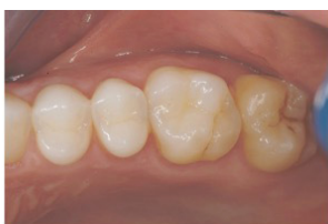
Upper left quadrant view, teeth parted (1:1.5 on most digital cameras)