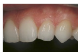
Left closeup view (1:1.5 on most digital cameras)