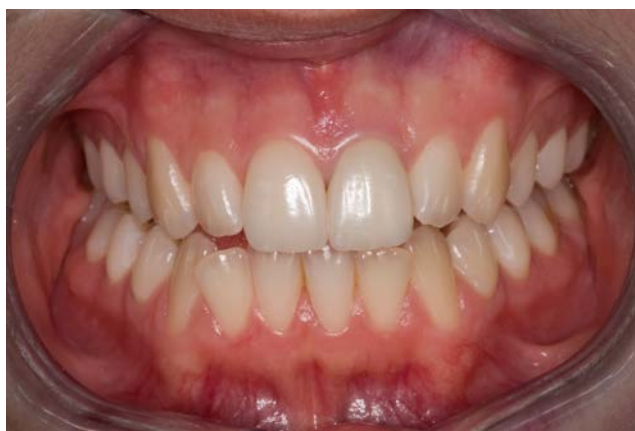
Two veneers were used to mask discolouration and improve shape