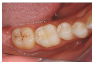
Lower right quadrant view, teeth parted (1:1.5 on most digital cameras)