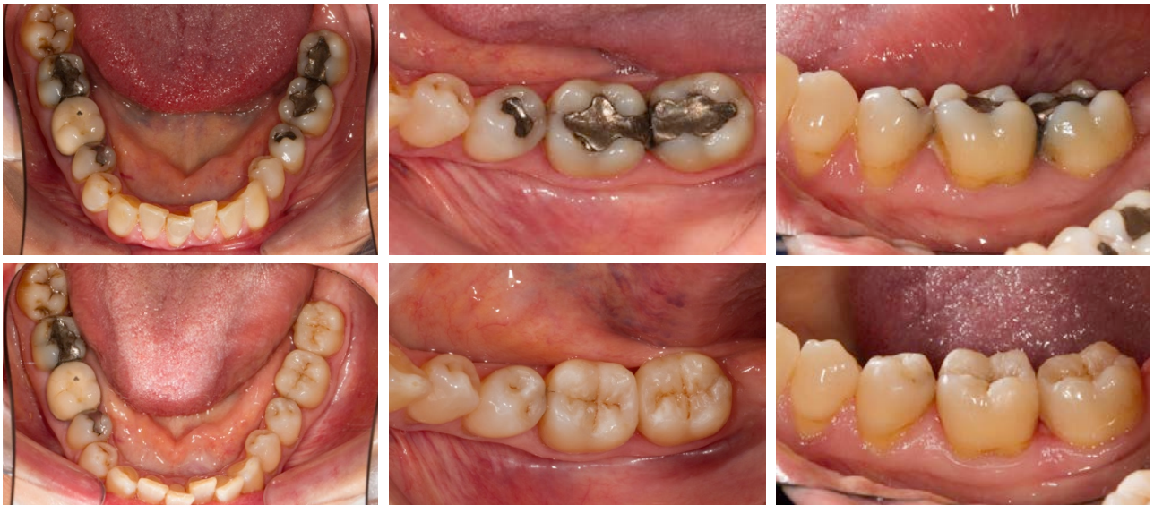
Direct resin restorations to replace old amalgams